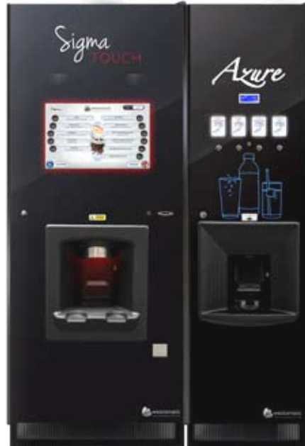
Coffee and water - the perfect partnership