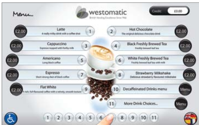
An example of the accessibility menu