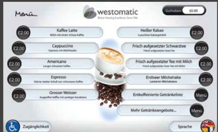
An example of a German menu, one of five languages that are available.

Simply add your adverts and logos via USB stick or telemetry and let the Sigma Touch become an essential marketing asset in promoting your business, products or services whilst at the same time serving delicious coffee shop quality drinks.